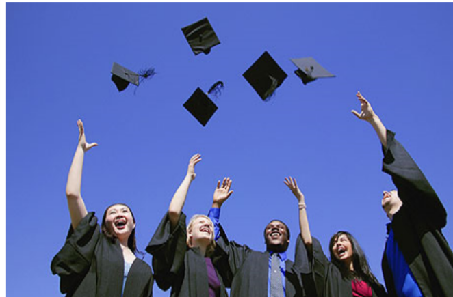
BHASVIC UCAS (University application timetable) 2017 / 2018

All universities want to increase their numbers of applications and will want to help.