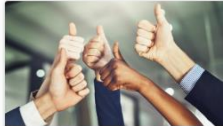
Library Hub Business BTEC Subject Resources