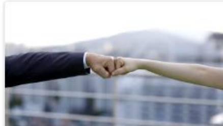
Estream for Business & Economics