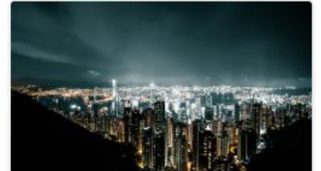
Library Hub Economics Subject Resources