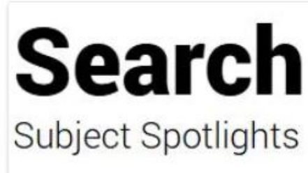
UCAS Subject Spotlights