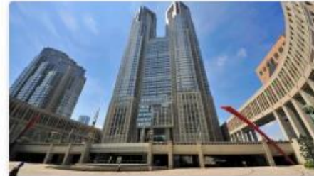
Library Hub Business A level Subject Resources