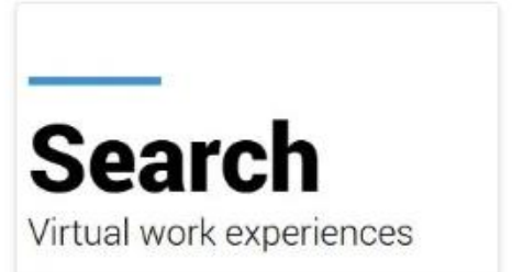
UCAS Virtual WEX