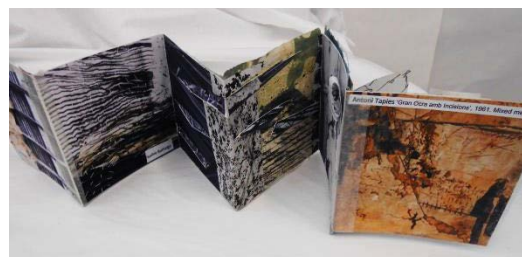
Example concertina book